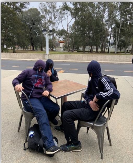
Year 7 boys were reluctant to show their identity!