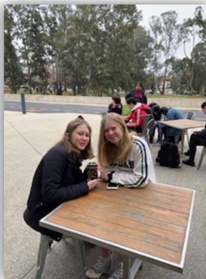
Year 7 and 8 girls outside the gallery