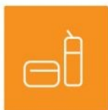
School Lunch Spreads + Snacks