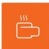
UHT Milk + Breakfast Food