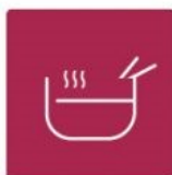
Pasta/Rice + Quick Meals