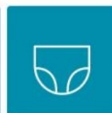
Nappies + Baby Needs